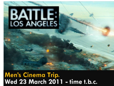
Men's Cinema Trip. Wed 23 March 2011 - time t.b.c.

11 Park Road, New Barnet. Outdoor play for young children in good weather, indoor toys too. Coffee & cakes. No prior knowledge required! carolunwin@gmail.com T: 0208 449 4043 Fortnightly in termtime